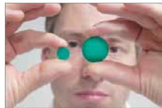
Unswollen (left) and swollen Q-TE-C sample