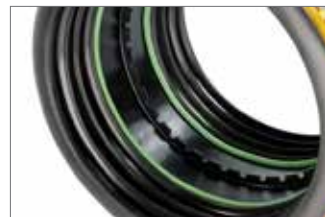
„Airbag seal“ made of Q-TE-C

Possible applications include flexurally rigid and flexurally flexible pipes. Smooth, ribbed or corrugated pipes can be connected to each other without additional compensating rings.